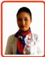
Kedongnou Rio Indigo Airlines