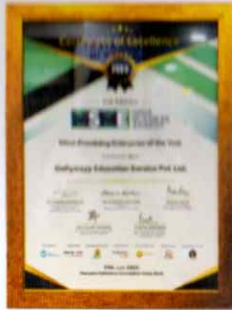
MOST PROMISING ENTERPRISE OF THE YEAR at the MSME INDIA BUSINESS AWARDS