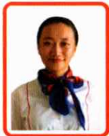
Chingpang K Phom Indigo Airlines