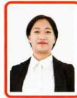
Saze Pfoze AIR INDIA