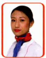
HOKALI SUMI CABIN CREW (GO FIRST)