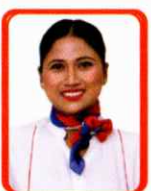
JAKSRAME CH MOMIN CABIN CREW (GO FIRST)