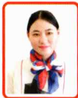
Lomika Awomi Indigo Airlines