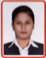
Hiya Das AIR INDIA