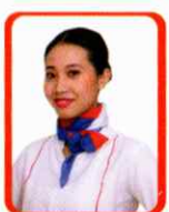
LEMNON KONYAK CABIN CREW (GO FIRST)