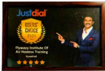
USERS' CHOICE AWARD by JUST DIAL