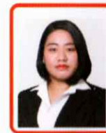
H.Mariine Pfoze AIR INDIA