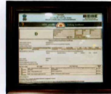
Certified by MSME