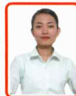
Lamnio Khiamniungan Indigo Airlines