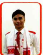
EVERWELL LYNGDOH CABIN CREW (GO FIRST)