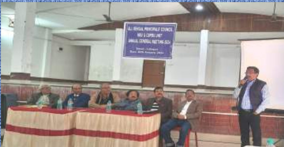
Addressing Annual General Meeting of All Bengal Principal Council NBU-CBPBU unit on 20 th January, 2024

I also wish the young learners all the best for achieving greater success and scaling new heights in their